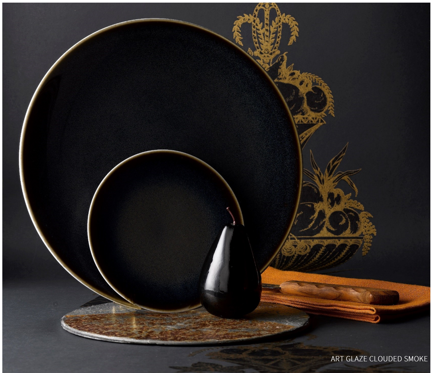
ART GLAZE CLOUDED SMOKE