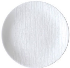
COUPE PLATE (FULL COVER)

15cm [6"] 62683 - (Fits 62682) 11.5cm [4.5"] 62681 - (Fits 62680)