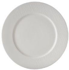
FLAT RIM PLATE