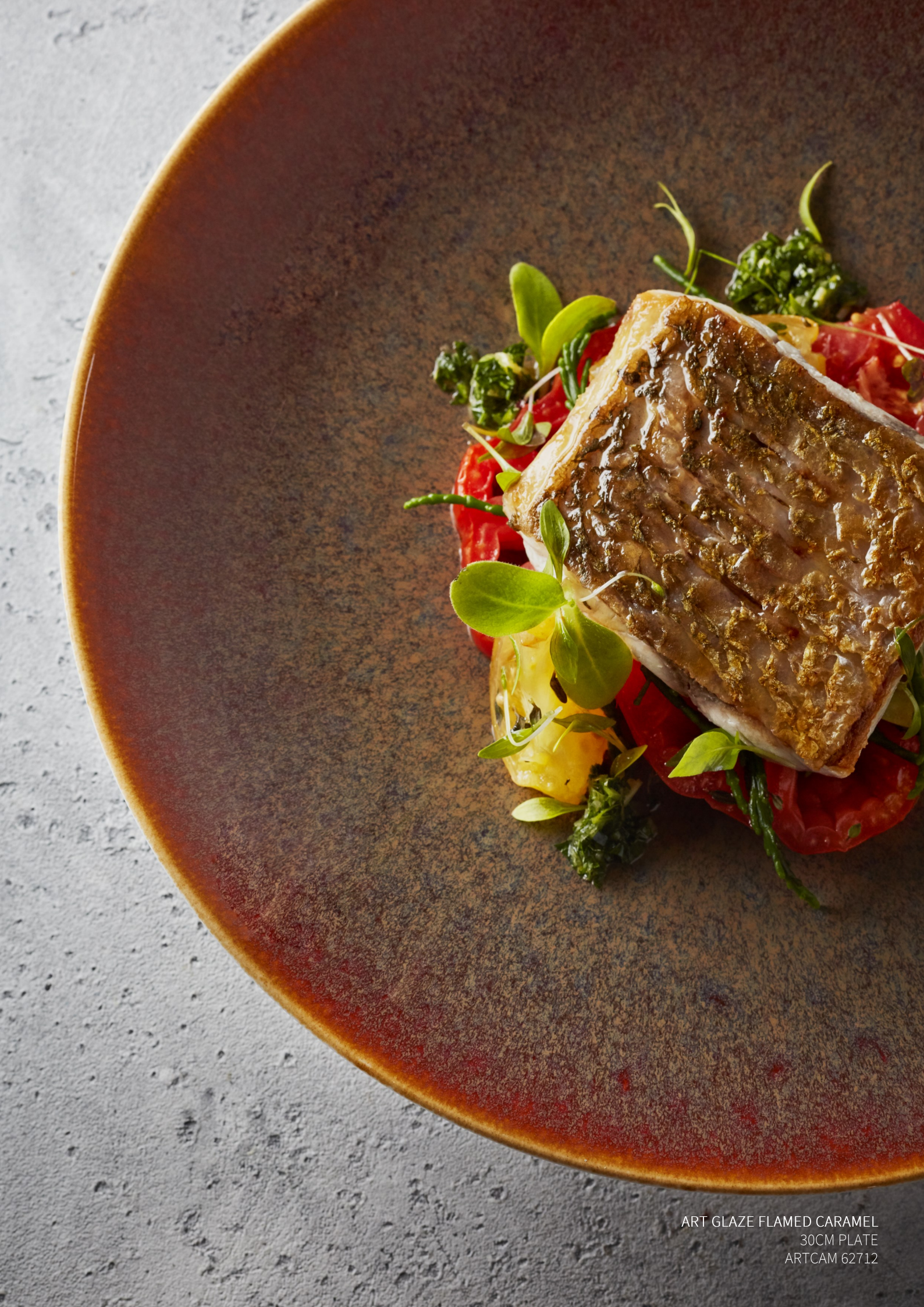
ART GLAZE FLAMED CARAMEL 30CM PLATE ARTCAM 62712