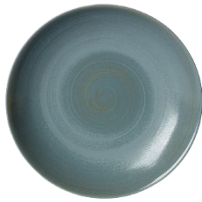
OCEAN WHISPER BRUBLU

Studio Glaze exhibits the very best of luxury tableware with a relaxed twist with each piece being unique due to its hand-applied decoration. Reactive pigments in combination with coloured glazes create a textured interplay of materials to deliver a silky sheen on the surface of each piece.