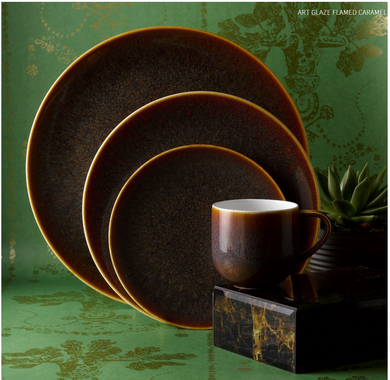
ART GLAZE FLAMED CARAMEL