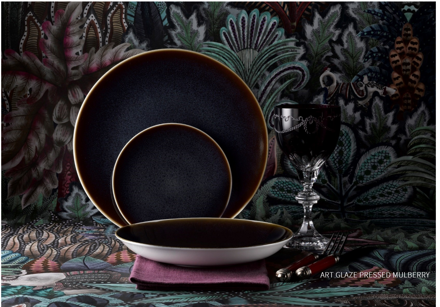
ART GLAZE PRESSED MULBERRY