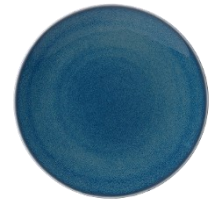
CANDIED SKY ARTLIB