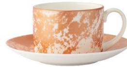
TEA CUP & SAUCER

25.5cm [10"] 62715 21cm [8.5"] 62702 16.5cm [6.5"] 62703