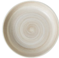
CLASSIC VANILLA BRUVAN