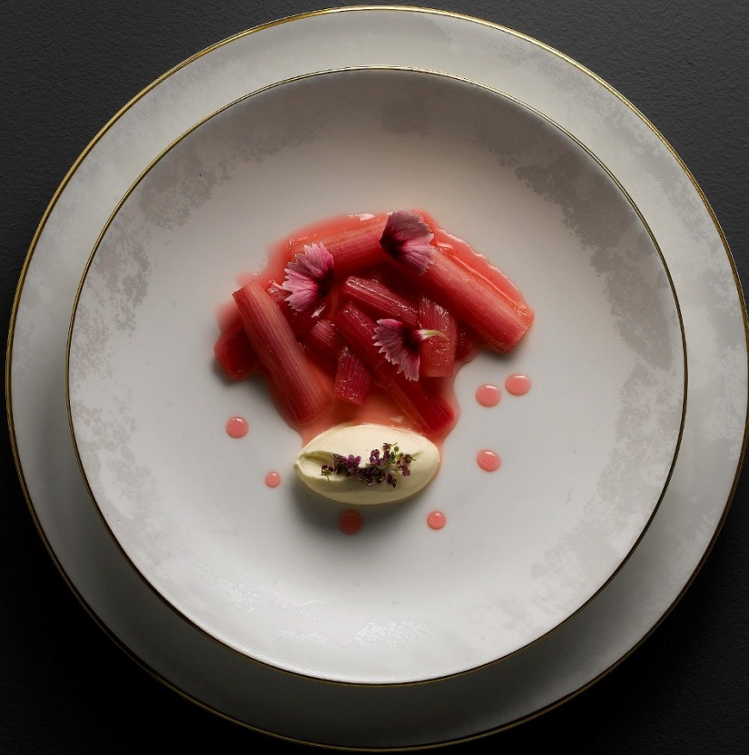
CRUSHED VELVET PEARL WITH GOLD LINE