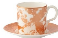
COFFEE CUP & SAUCER