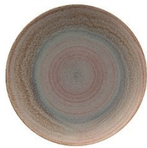
COASTAL BLUE ECOCBL

Echoing the stunning landscapes of England's South Coast where Royal Crown Derby's china clay is mined, highly intricate finishes provide a captivating backdrop for any chef and will spark the imagination of every diner.