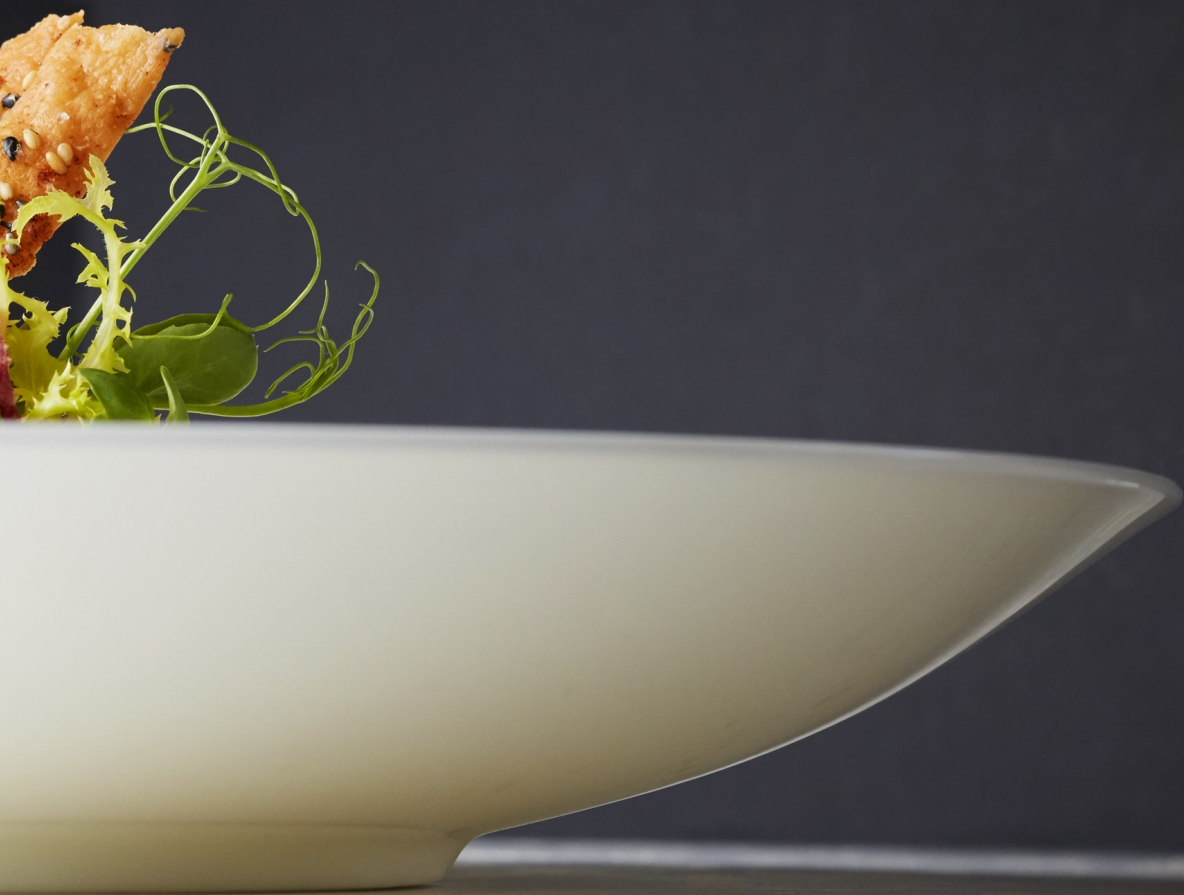
WHITEHALL 25.5CM COUPE BOWL WHIALL 62708