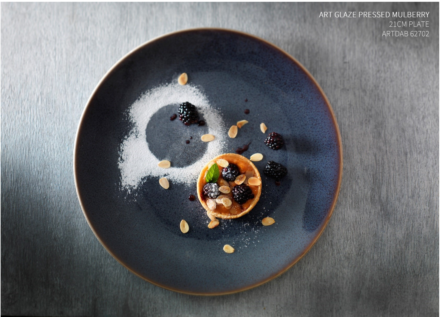
ART GLAZE PRESSED MULBERRY 21CM PLATE ARTDAB 62702