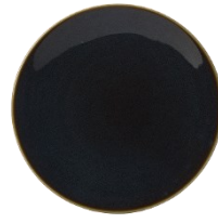
CLOUDED SMOKE ARTBLK