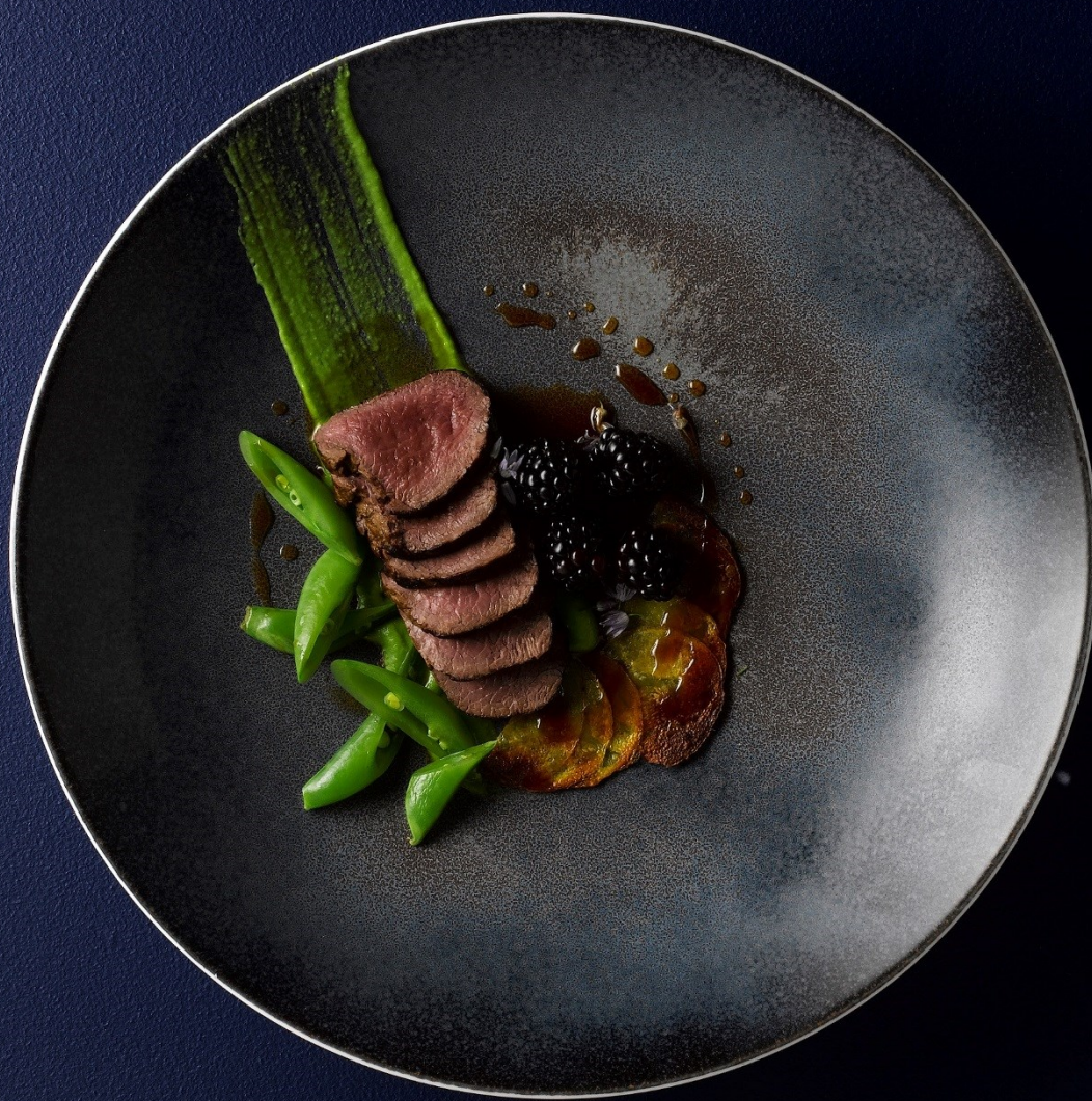
REBEL 27CM COUPE PLATE REBDAB 62701