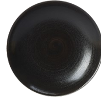
ALMOST MIDNIGHT BRUBLA