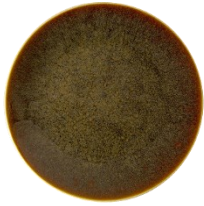
FLAMED CARAMEL ARTCAM

The four coloured glazes have been developed to be beautiful individually, or in contrast with each other. Special attention has been given to deliver a refreshing, high-end presentation platform to best showcase chef-driven menus