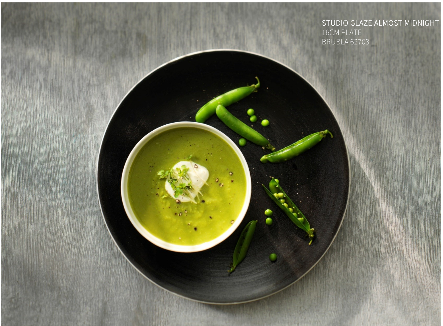
STUDIO GLAZE ALMOST MIDNIGHT 16CM PLATE BRUBLA 62703