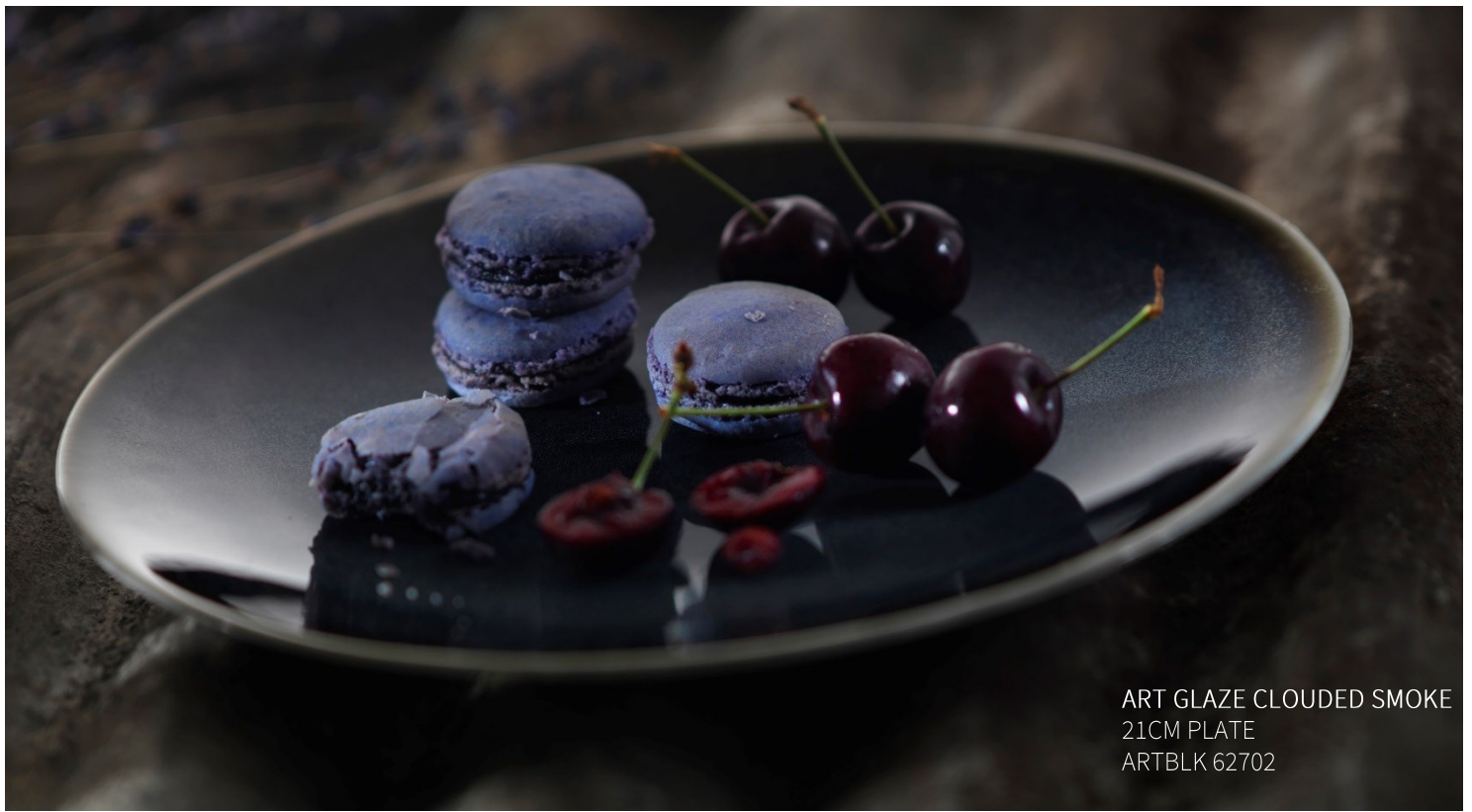
ART GLAZE CLOUDED SMOKE 21CM PLATE ARTBLK 62702