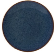
PRESSED MULBERRY ARTDAB