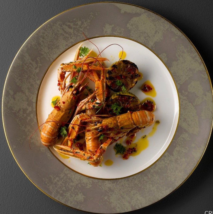
CRUSHED VELVET GREY WITH GOLD LINE