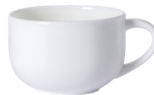
TEA CUP *

22.5cl [8oz] WHIALL 62682 8.5cl [3oz] WHIALL 62680