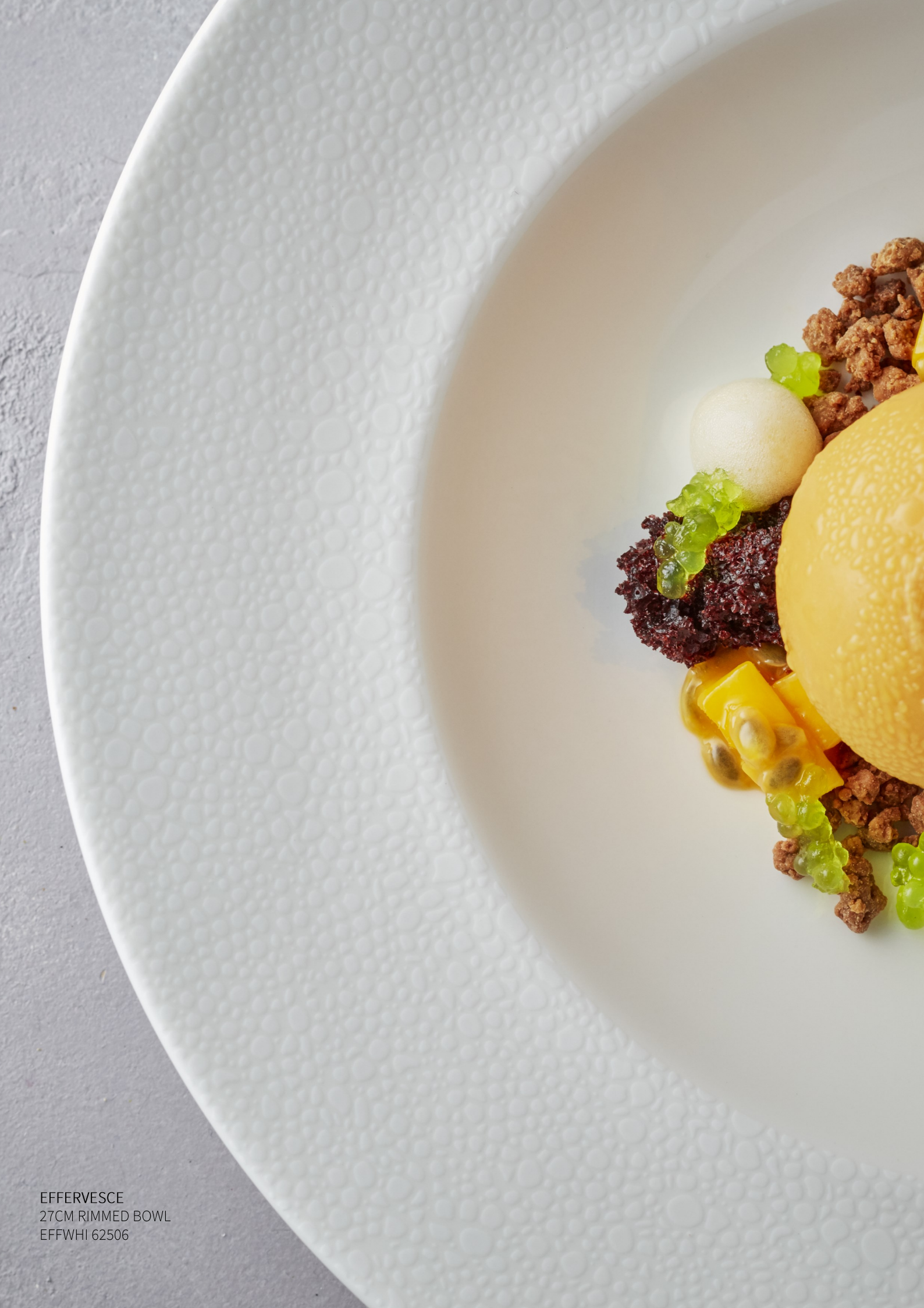
EFFERVESCE 27CM RIMMED BOWL EFFWHI 62506