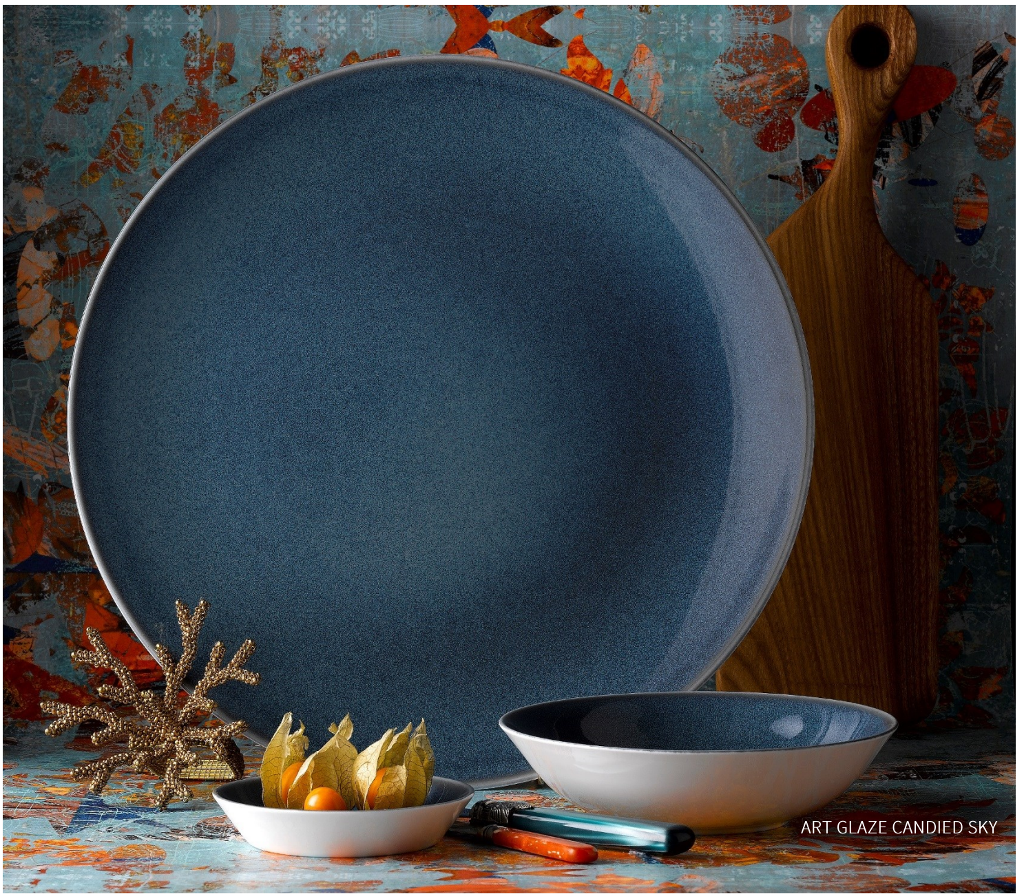
ART GLAZE CANDIED SKY