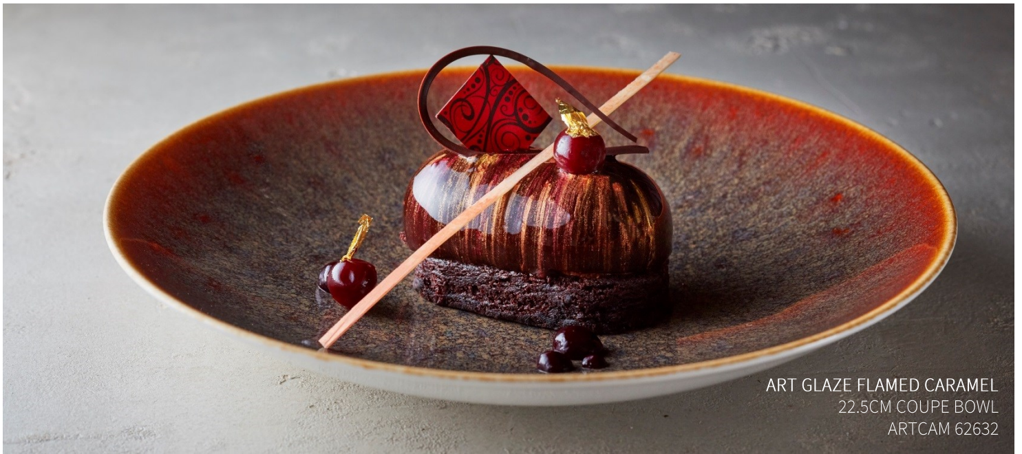
ART GLAZE FLAMED CARAMEL 22.5CM COUPE BOWL ARTCAM 62632