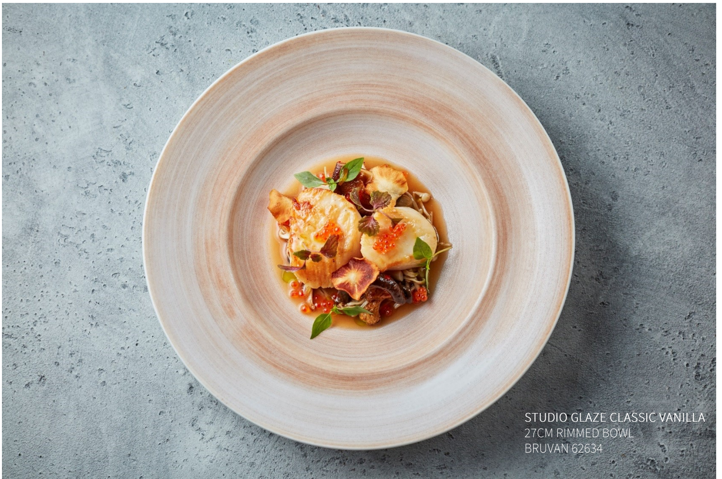
STUDIO GLAZE CLASSIC VANILLA 27CM RIMMED BOWL BRUVAN 62634